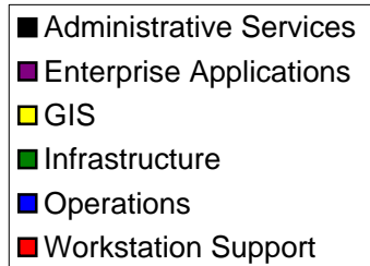
Did Not Meet Date Needed