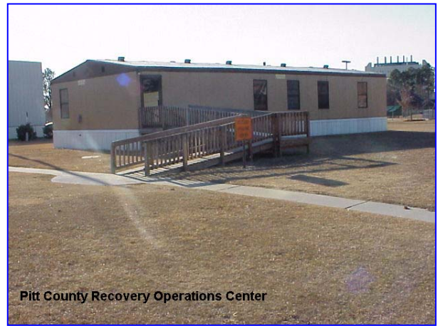
Pitt County Recovery Operations Center

Housing Recovery Strategy - In April 2000, the Board of County Commissioners appointed the Pitt County Community Task Force to develop a Housing Recovery Strategy following the flood event. The task force consisted of members of local government, faith-based organizations, and flood survivors. Planning Department staff members were involved with compiling, developing and recommending a draft Housing Recovery Strategy. The strategy was adopted by the Board of County Commissioners on June 19, 2000, and outlined steps to assist county flood victims with various housing needs.