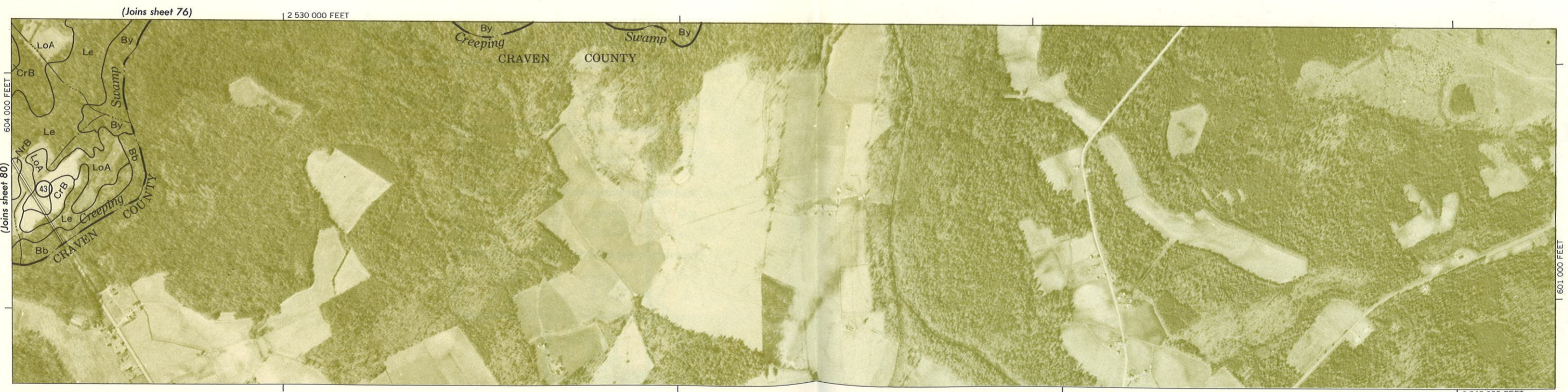
3000 AND 5000-FOOT GRID TICKS

Photobase from 1971 aerial photography. Positions of 5,000-foot grid ticks are approximate and based on the North Carolina coordinate system. This map is one of a set compiled in 1973 as part of a soil survey by the United States Department of Agriculture, Soil Conservation Service, and the North Carolina Agricultural Experiment Station.